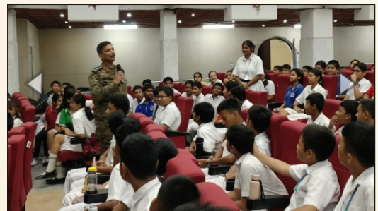
GUEST SPEAKER'S PROGRAMME