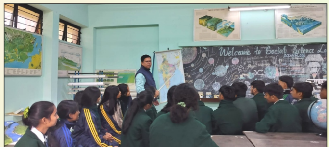
SOCIAL SCIENCE LAB