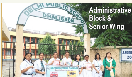
Administrative Block & Senior Wing