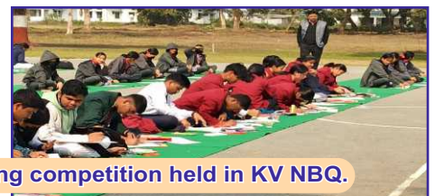
Students' participation in painting competition held in KV NBQ.