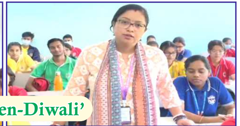
Teachers spreading awareness on 'Green-Diwali'